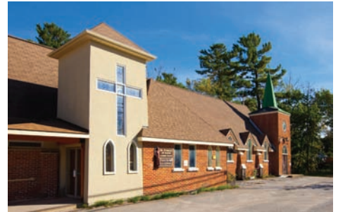
ST. FRANCIS - WASHAGO