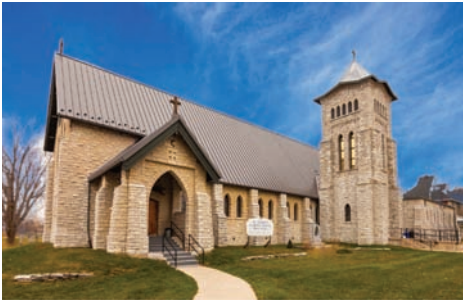
ST. ANDREW'S - BRECHIN