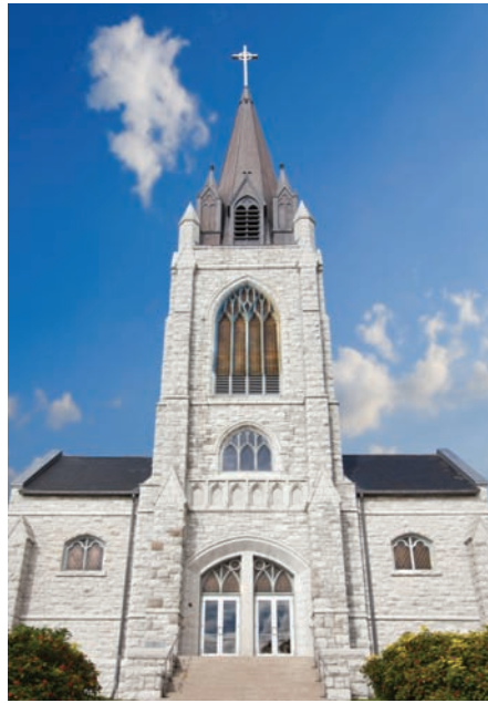
GUARDIAN ANGELS - ORILLIA