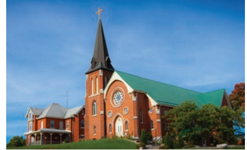
ST. COLUMBKILLE - UPTERGROVE