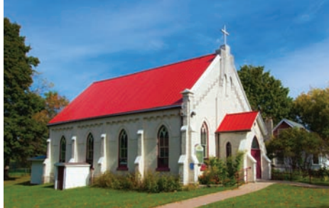
SACRED HEART - WARMINSTER