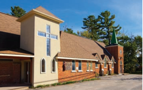
ST. FRANCIS - WASHAGO

ASS IMES <u>St. Andrews</u> Sunday 9:30am <u>Sacred Heart</u> Sunday 8am