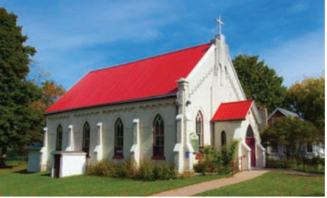
Sacred Heart - Warminster

Guardian Angels Weekdays 12:10pm Saturday 9am