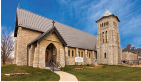
ST. ANDREW'S - BRECHIN