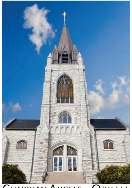
GUARDIAN ANGELS - ORILLIA