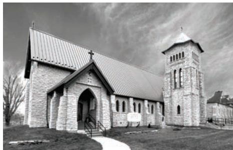
ST. ANDREW'S - BRECHIN