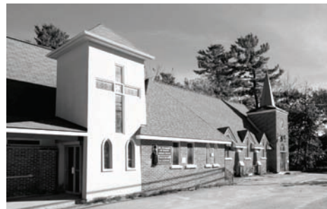
ST. FRANCIS - WASHAGO