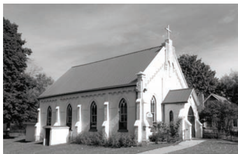
SACRED HEART - WARMINSTER