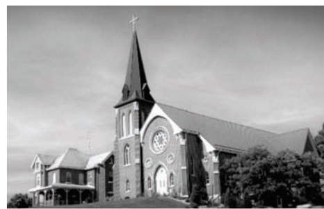
ST. COLUMBKILLE - UPTERGROVE